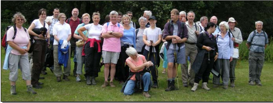
Walking in Hartley Wintney 2009